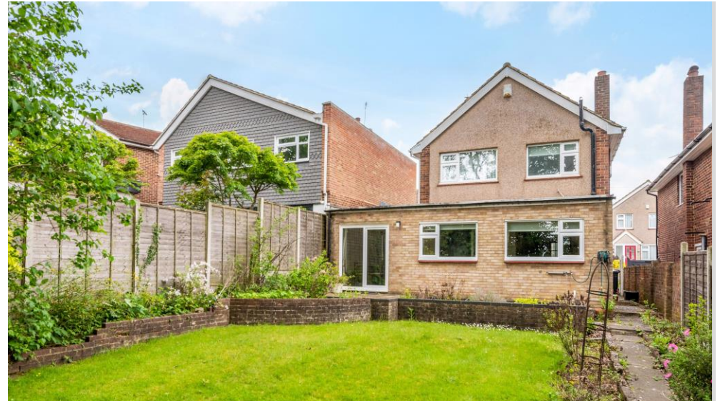
CHALET CLOSE JOYDENS WOOD BEXLEY DA5 2EY Guide Price £600,000 | Freehold